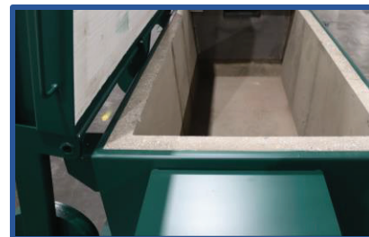
AIS 033 Cyclone Main Chamber View

* Burn Rates dependant on usage and waste type and may be subject to your local regulations. Speak to a member of our team for more information.