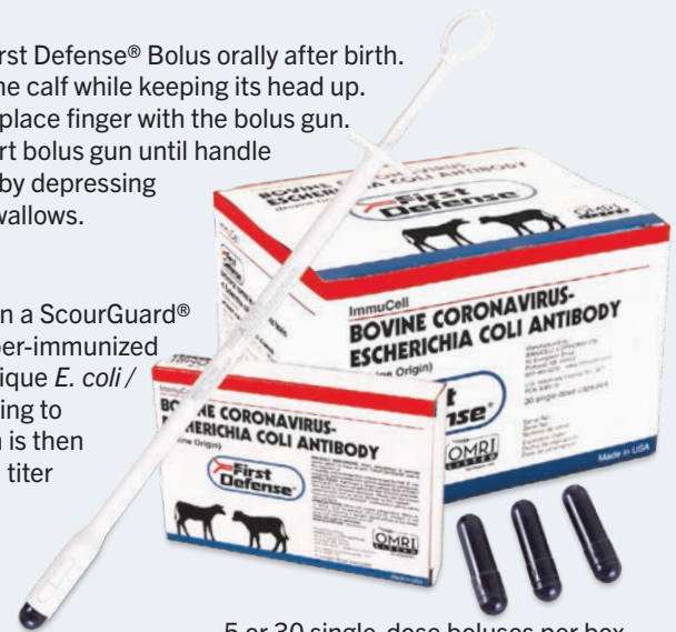
5 or 30 single-dose boluses per box.

Lactation 2+ cows from donor herds on a ScourGuard® or Guardian® vaccine regimen are hyper-immunized with multiple rounds of ImmuCell's unique E. coli / coronavirus vaccine in the weeks leading to calving. Their antibody-rich colostrum is then collected, purified, concentrated, and titer levels standardized to guarantee a consistently high level of E. coli and coronavirus antibody in every dose of Dual-Force and First Defense Bolus.