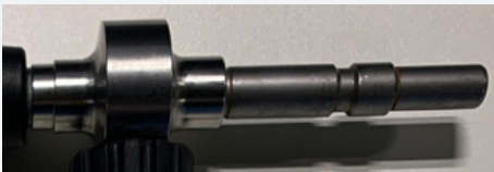
In the image a KEW coupling. This can be tightened using an Allen key.